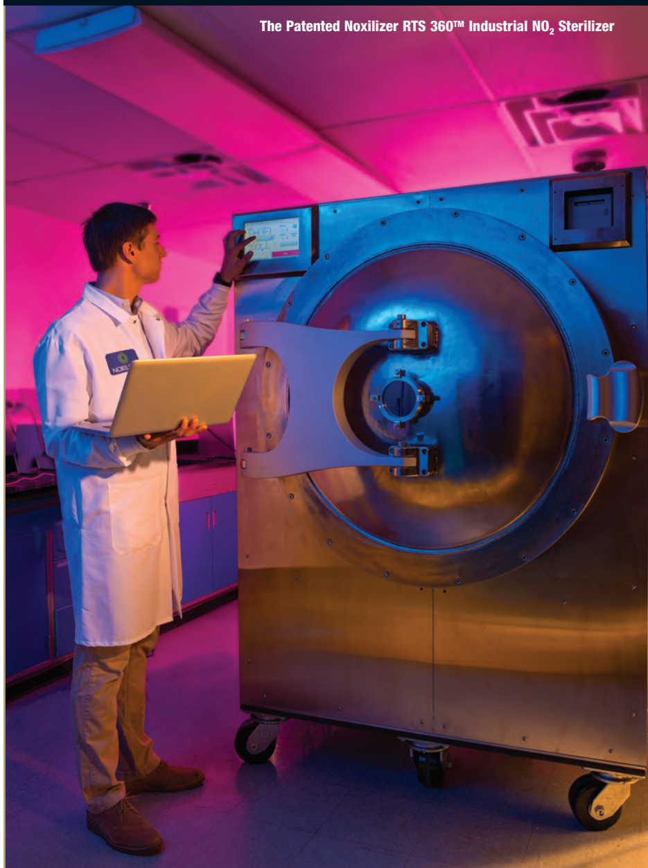
The Patented Noxilizer RTS 360™ Industrial NO 2 Sterilizer

bringing sterilization in-house easy and safe, resulting in faster turnaround times.